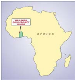
Azumah Resources Limited ACN 112 320 251